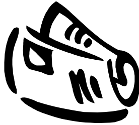
Student Lead Ministry